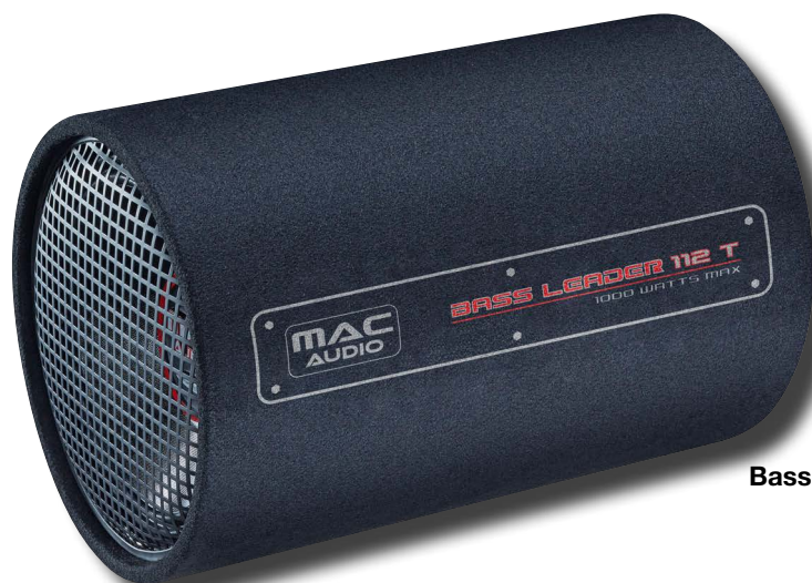
Bassleader 112 T