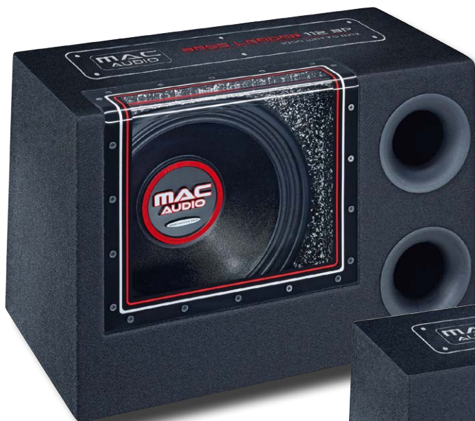
Bassleader 112 BP