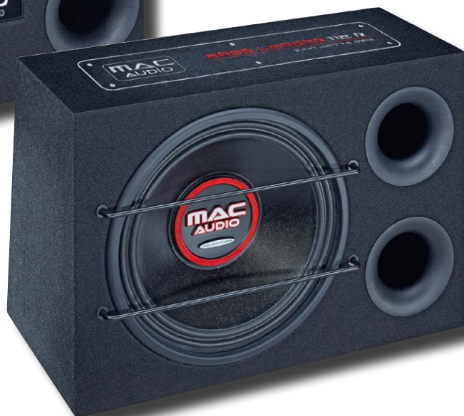
Bassleader 112 R